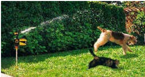
Animals run when Scarecrow sees them!

The Scarecrow is a clean alternative to smelly, poisonous, or visually disruptive repellents. It is widely endorsed and less expensive than physical barriers. If you've tried other solutions that failed, you're ready for a Scarecrow. Entering its fourth year, it is now more economical, effective and widely available than ever.