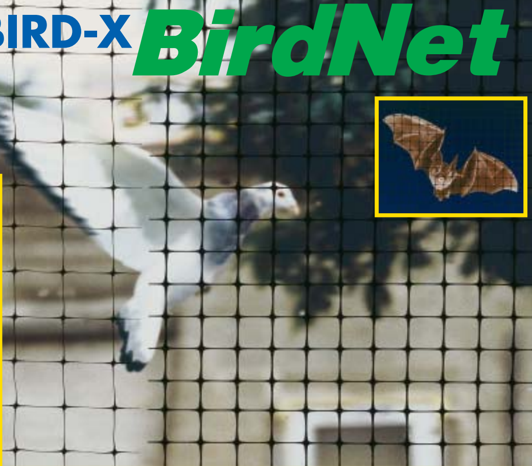
"Standard" (not actual size)